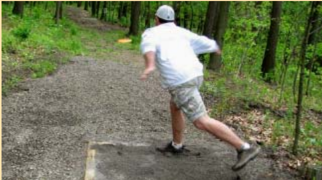
A player tees off at the May 8th grand opening of the Two Mile Run Extension Disc Golf Course.

Fourth Wednesday of each month - 7:00 p.m. Third Wednesday in November & December.