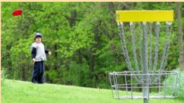
Disc golfers of all ages participated in the May 8th grand opening of the Two Mile Run Extension Disc Golf Course. Disc golf is a recreational opportunity for the entire family.