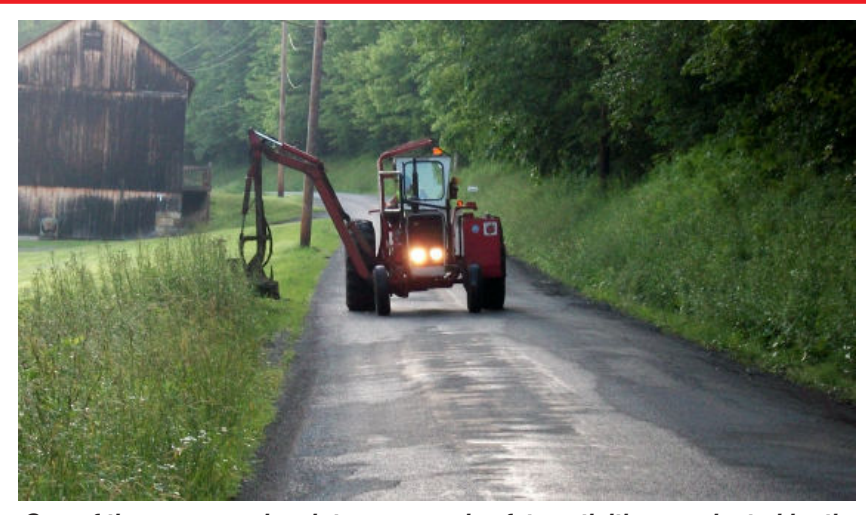
One of the many road maintenance and safety activities conducted by the Road Department is roadside mowing as shown in the above photograph.

The Beaver Area Heritage Museum's summer fall 2011 display, Beaver Valley Album , features a visually stunning array of vintage, archival photographs of Beaver and surrounding communities. Most of the images are from the Arnold McMahon/Graule Studios Collection in Rochester, comprised of historic photographs and negatives from the 1800's to present day. This large collection, curated by Kevin and Barb Cooke, includes early Beaver County businesses, architecture, people, events, railroads, steel mills and various industries (such as J&L Steel and Fry Glass). It is the largest archive of Beaver County photography, housing several thousand images. Beaver Valley Album highlights more than 70 prime selections of images such as a barber shop in Freedom circa 1900, a Baby Bear Bread truck in Beaver in 1933, the last wagon used by Keystone Bakery in West Bridgewater in 1917, Mutual Union Brewery in West Aliquippa in 1910, and a storm scene near the Beaver County Courthouse in June 1924. For more, visit <a href="http://www.beaverheritage.org/current.htm">http://www.beaverheritage.org/current.htm</a>.