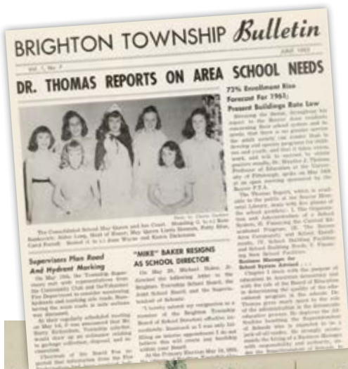
Left: The Township had its own Community Club in the early 1950s. They met in the elementary school’s large basement and published the Brighton Township Bulletin newsletter, shown above.

Every other weekday, a new post will be made featuring an aspect of the township’s rich history over the past 200 years. Join us for this nostalgic trip of history that covers two centuries of time by liking and sharing the posts - and sharing your own images past and present at facebook.com/brightontwp .