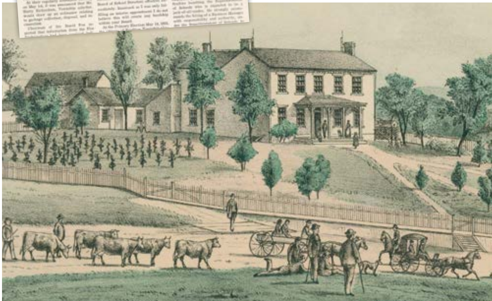
Below: Hand-tinted image from the 1876 Atlas of Beaver County shows the Pleasant View residence of Judge E.J. Wilson on Tuscarawas Hill, one mile from Beaver – his “farm consisting of 52 acres, and 10 acres of timber land, from 6 to 7 fine springs, also the best fruit and 1500 grape vines.”