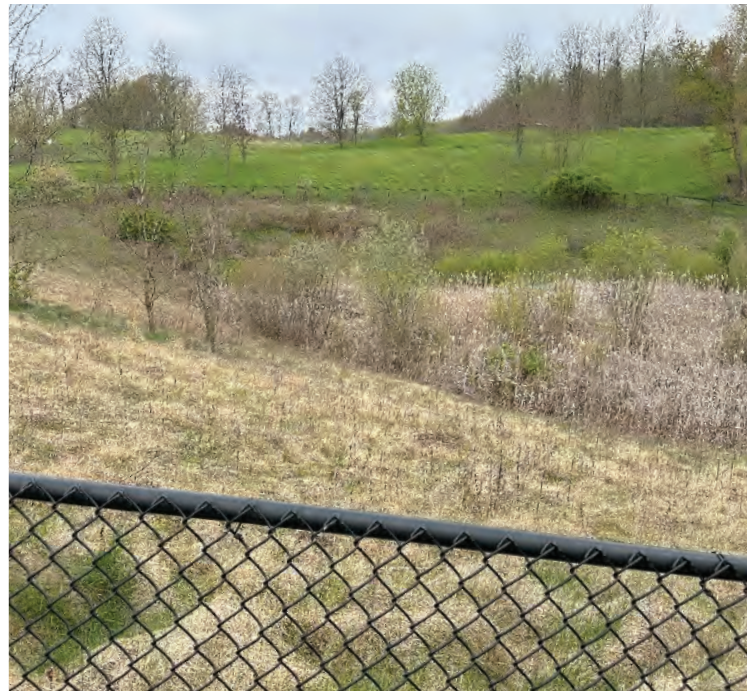
Figure 2: Facility Exhibiting Overgrowth