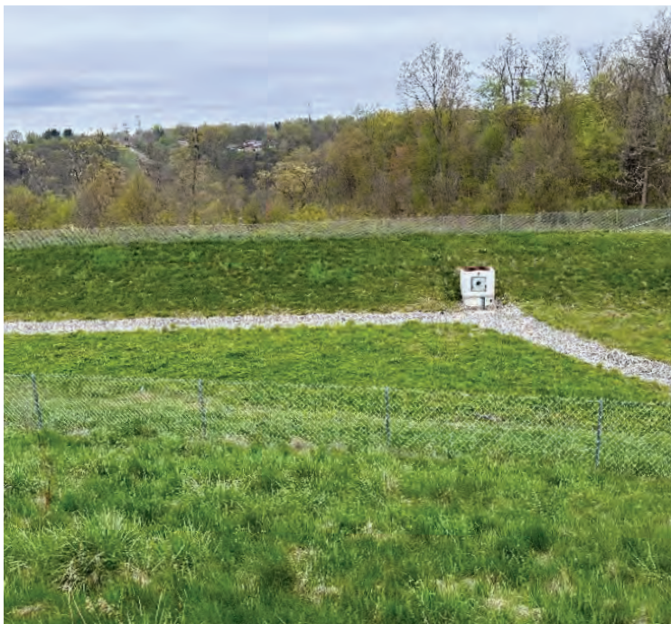
Figure 1: Well Maintained Facility